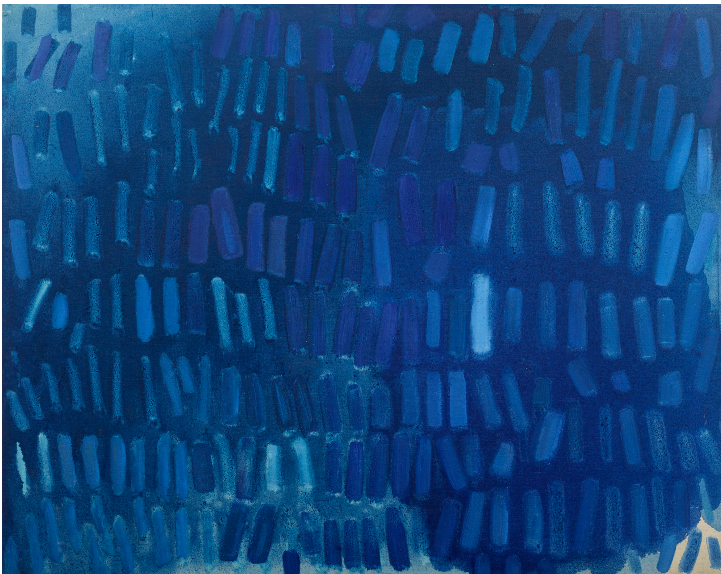
WINDOW NO. 1, 1963, OIL ON CANVAS, 39½ X 49½ IN.