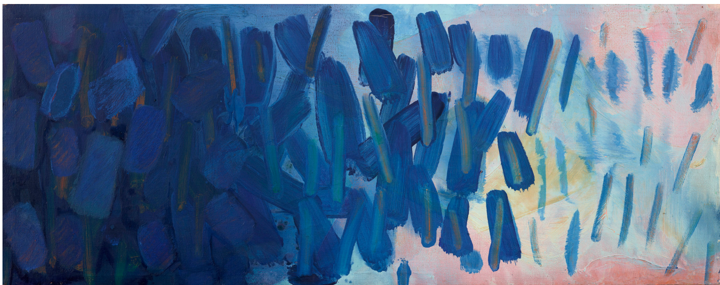
UNTITLED, 1964, OIL ON CANVAS, 13½ X 34½ IN.

this because it reminds us of the sea, or something else to which we free-associate, or is it just the color itself to which we are innately drawn?