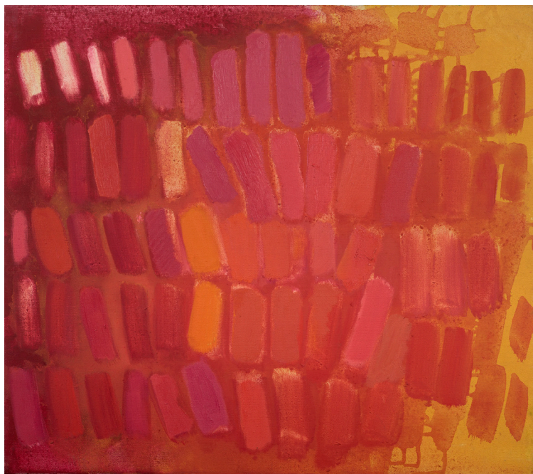
VARIATIONS, 1963, OIL ON CANVAS, 21½ X 24¾ IN.