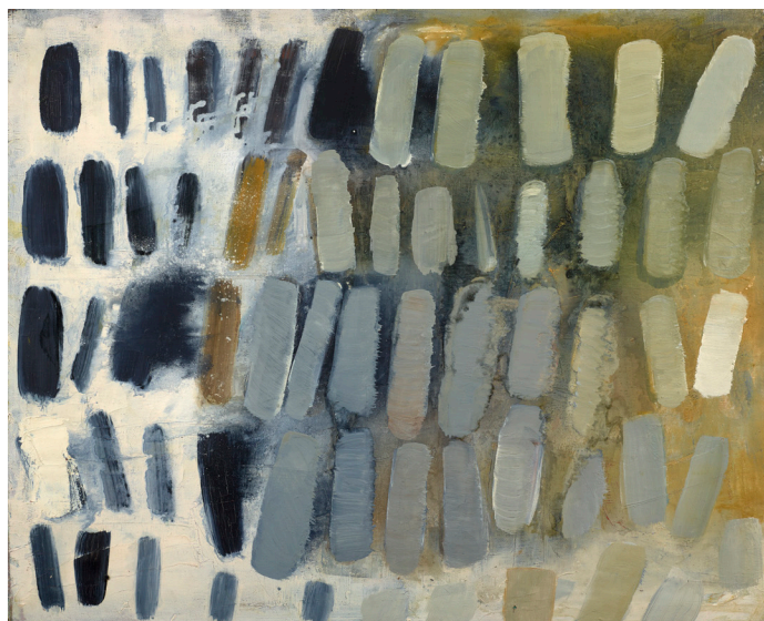
UNTITLED, 1964, OIL ON CANVAS, 19½ X 24 IN.