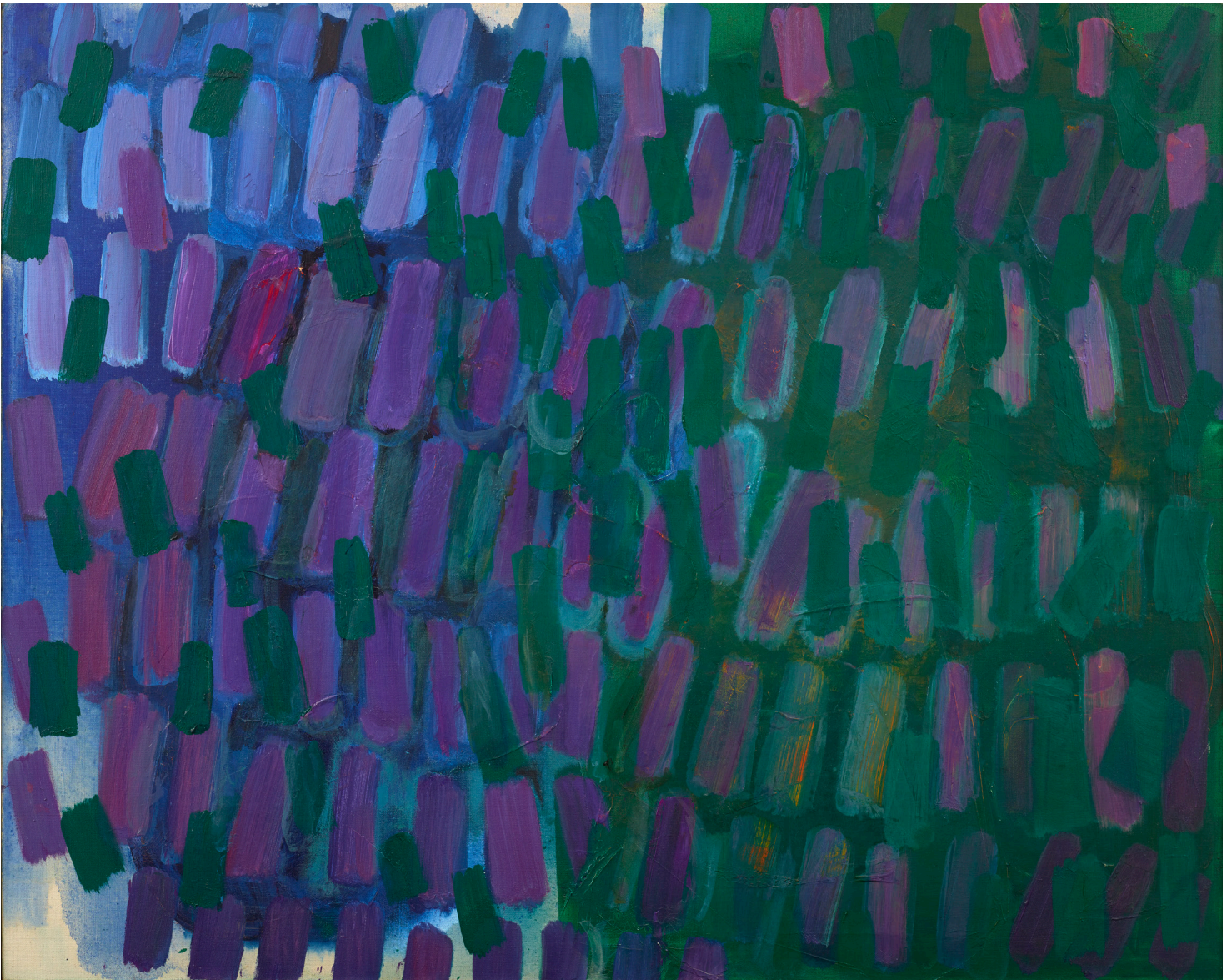
THE GARDEN , 1963, OIL ON LINEN, 32 \frac{3}{4} X 40 \frac{1}{2} IN.

COVER: BLUE GREEN NO. II (DETAIL) , 1963, OIL ON CANVAS, 40 X 50 IN.